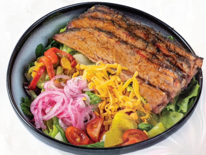
SMOKED BRISKET SALAD

All our delicious food is prepared in an environment that contains nuts and gluten. Photos displayed on our menu may vary due to promotional use. The price includes 5% VAT.