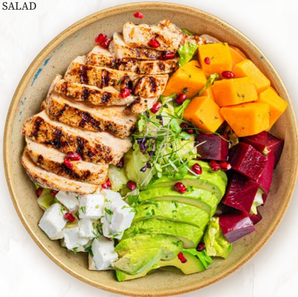
BUTTERNUT SQUASH SALAD

Fresh broccoli, heavy cream, onion, garlic, thyme, served with focaccia bread.