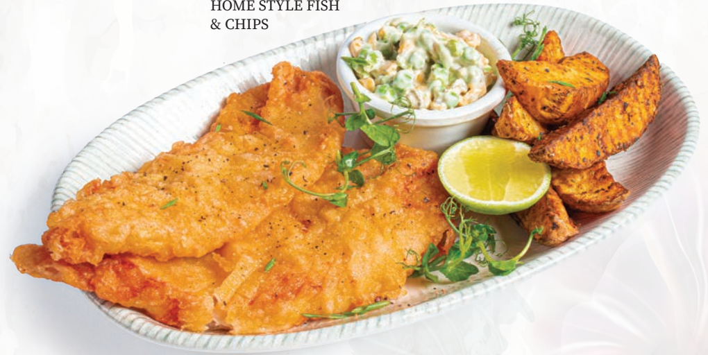
HOME STYLE FISH & CHIPS

All our delicious food is prepared in an environment that contains nuts and gluten. Photos displayed on our menu may vary due to promotional use. The price includes 5% VAT.