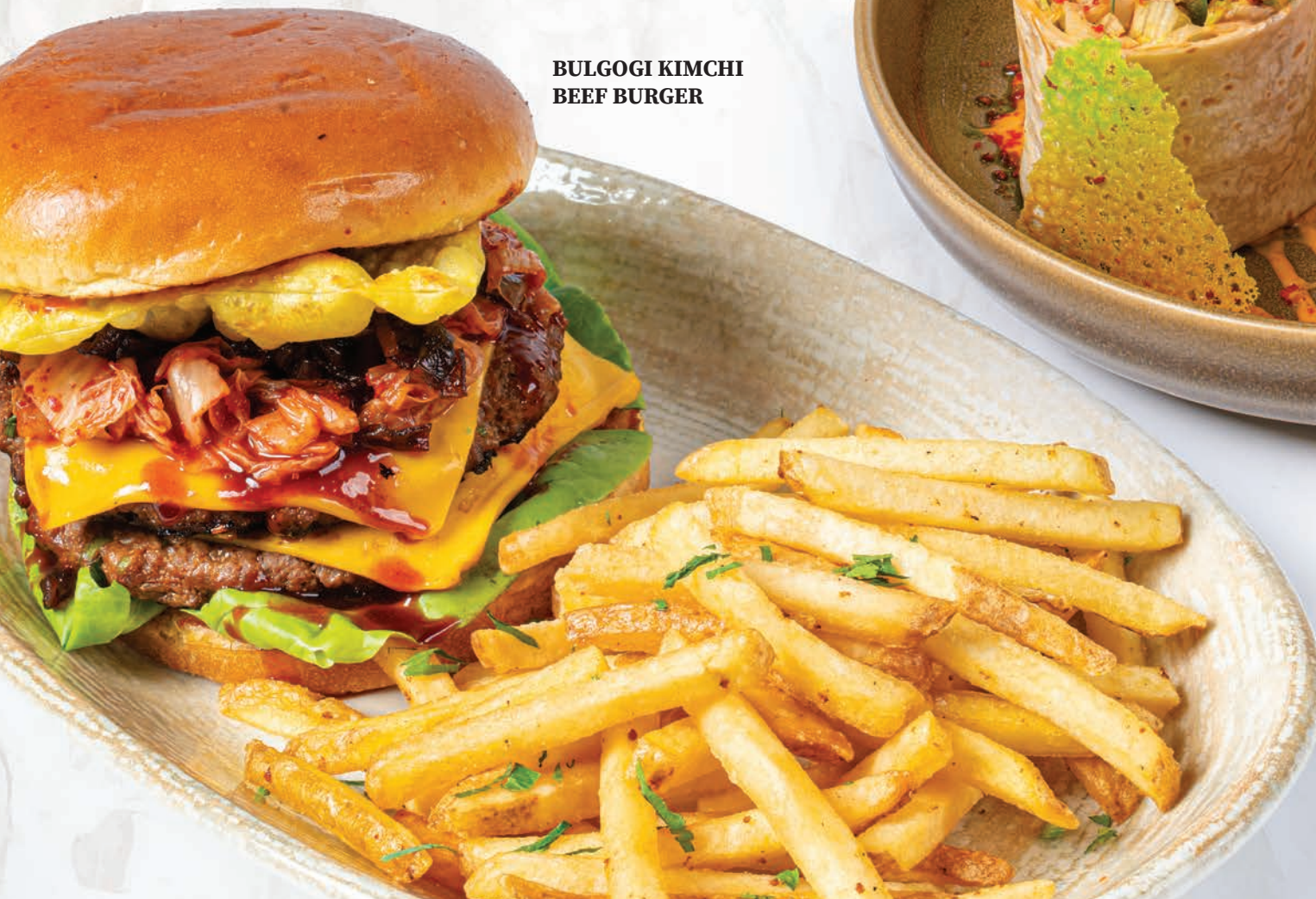
BULGOGI KIMCHI BEEF BURGER