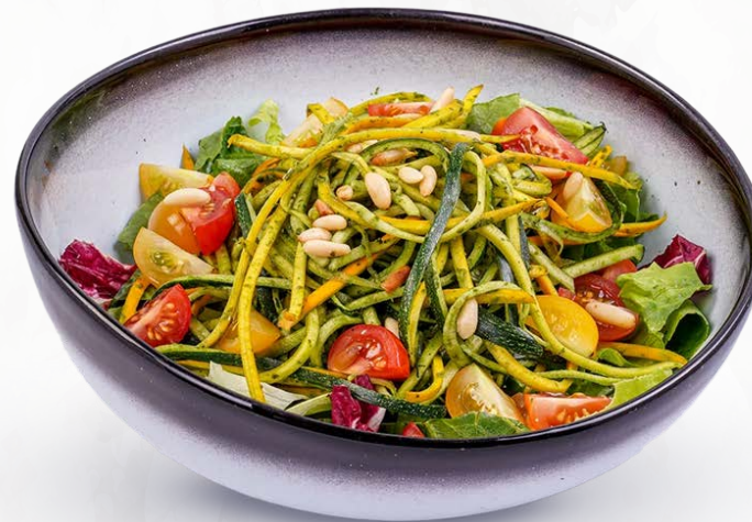
PESTO ZOODLES SALAD

Zucchini zoodles, Kenyan beans, broccoli, cherry tomato, mixed greens, pine nuts, and vegan pesto sauce.