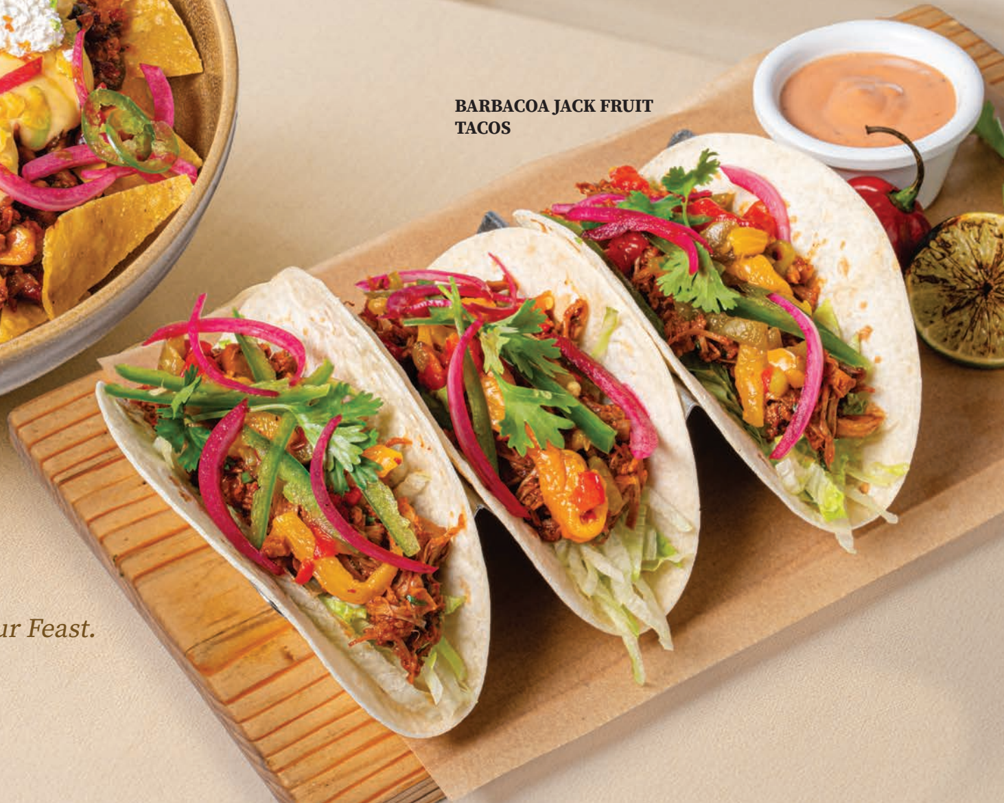
BARBACOA JACK FRUIT TACOS

Perfectly Crafted Bites to Begin Your Feast.