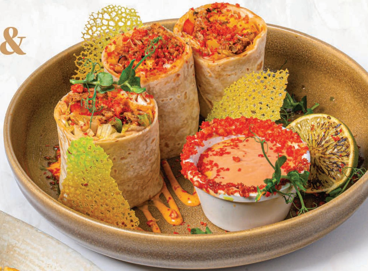
JACKFRUIT CARNITAS WRAP