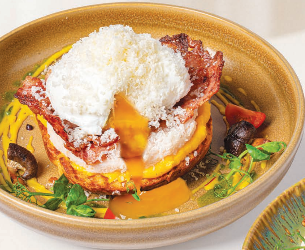
BRIOCHE EGG BENEDICT