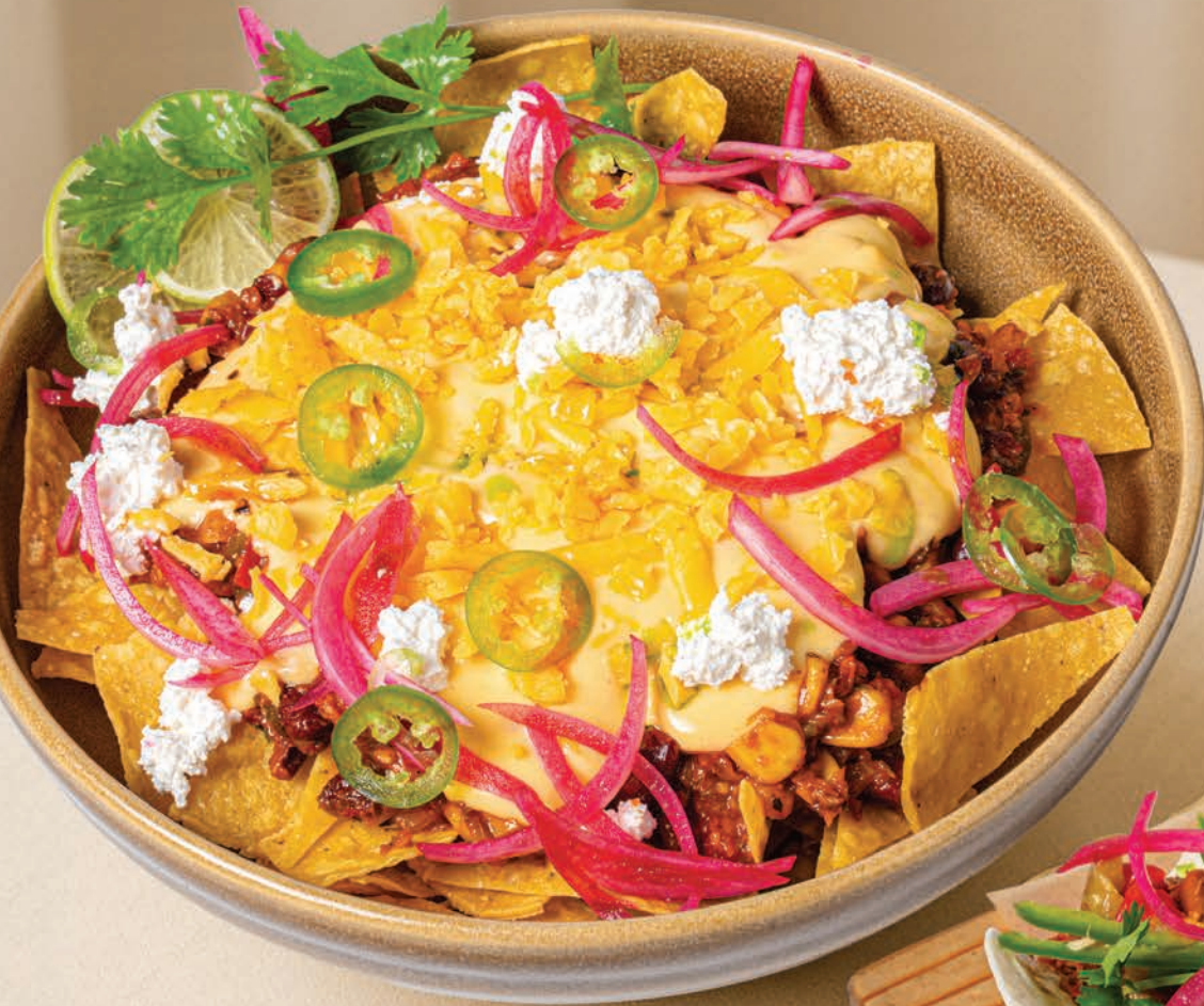
MEXICAN CORN & BEAN NACHOS

Perfectly Crafted Bites to Begin Your Feast.